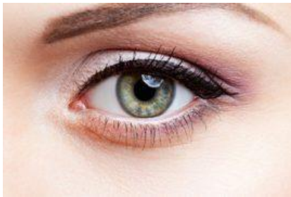
Permanent Make up Correction